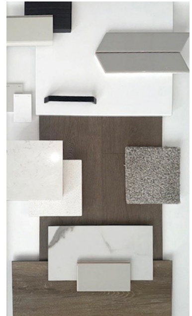
INTERIOR FINISHINGS | SOOKE

Contact our sales team for more information: belvedere@crystalcreekhomes.ca | 403-984-3501