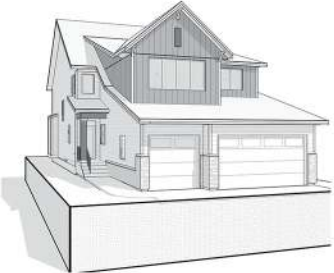
◀ Modern Beach