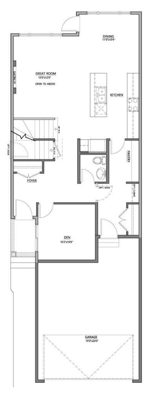
9′ 1″ Main Floor | 984 sqft