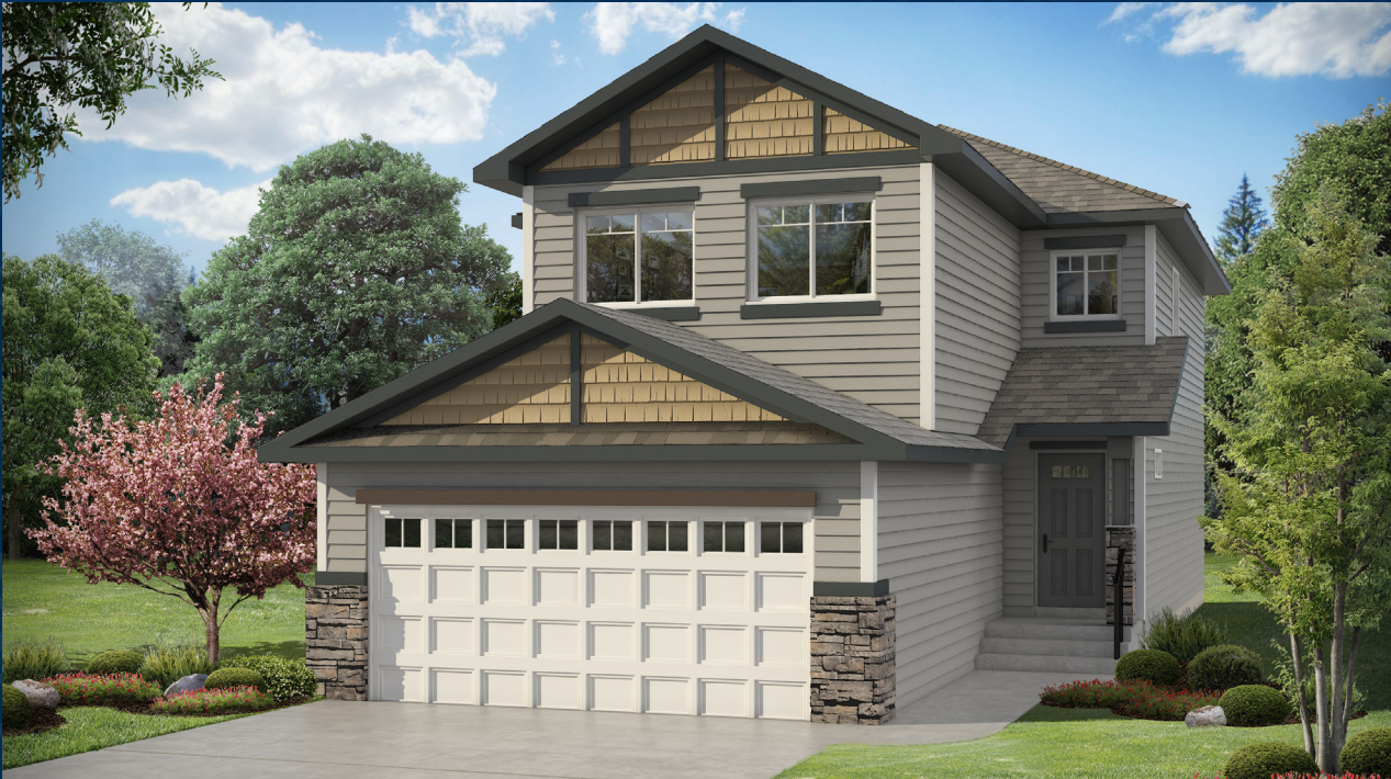
2075 sq. ft. | Two Storey | Elevation B

This design is published by Crystal Creek Homes, all rights reserved, including the reproduction in whole or in part. Dimensions, square footage and details shown are approximate and may be subject to change without notice. Details may vary by specification and elevation.