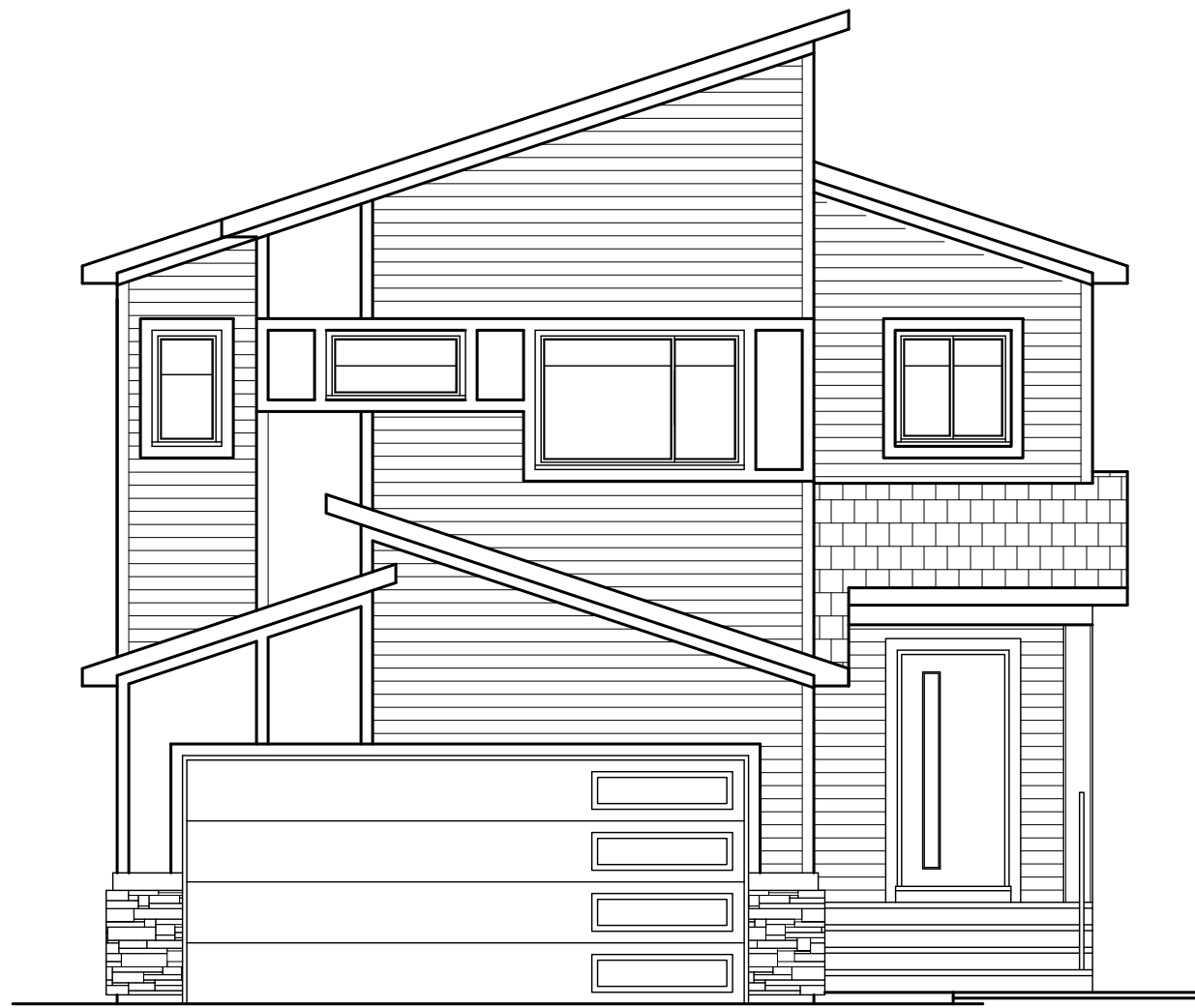
FRONT ELEVATION CONTEMPORARY