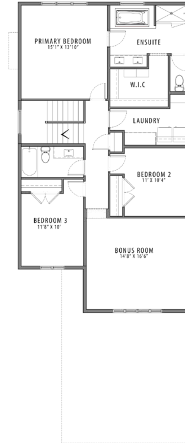
UPPER FLOOR | 1326 SQ FT