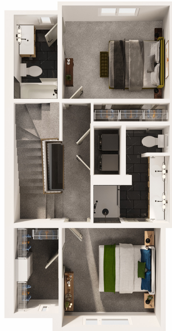
Second Floor | 661 SQ. FT