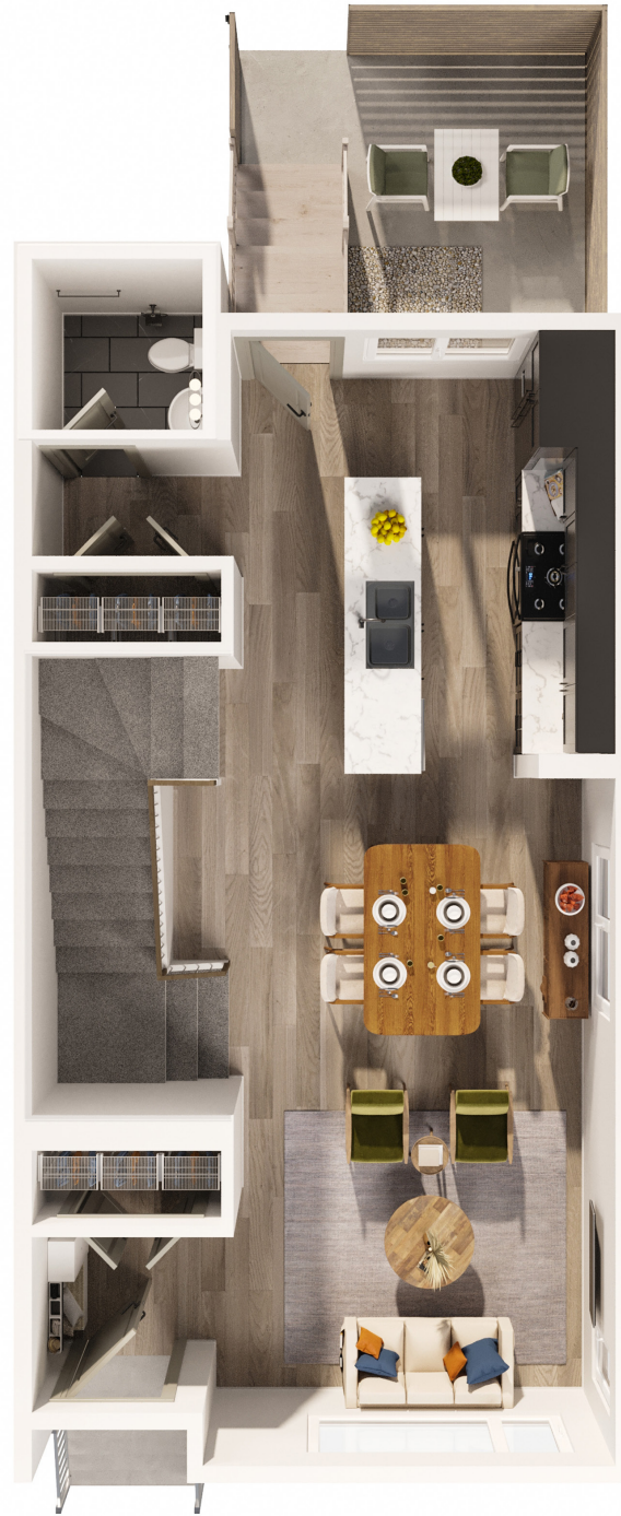
Main Floor + Patio | 727 SQ. FT

Interior Finishes include designer cabinetry, Black Stainless Steel KitchenAid Appliances, Silgranite Undermount Sink, Quartz countertops, Luxury Vinyl Plank Flooring, full height Tile Backsplash, Upgraded Lighting Fixtures, Black Hardware, and a stacked full size Washer and Dryer.