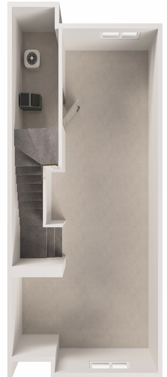
Undeveloped Basement | 551 SQ. FT