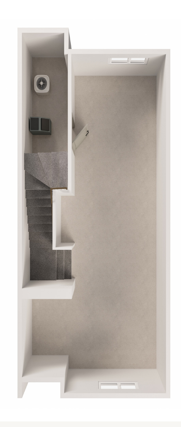
Undeveloped Basement I 551 SQ. FT