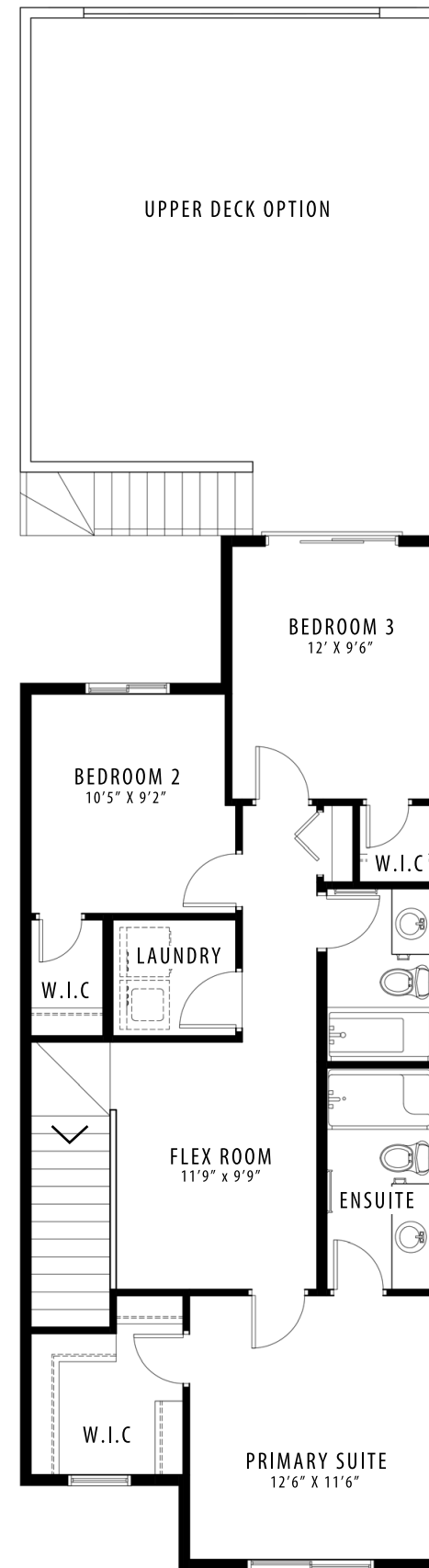
UPPER FLOOR | 883 SQFT