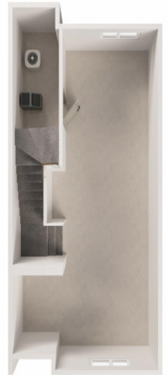
Undeveloped Basement | 571 SQ. FT