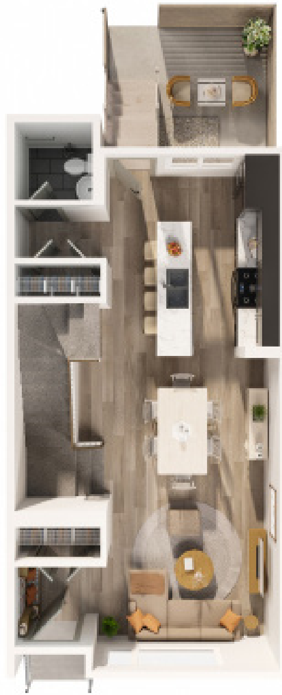
Main Floor + Patio | 723 SQ. FT

Interior Finishes include designer cabinetry, Black Stainless Steel KitchenAid Appliances, Silgranite Undermount Sink, Quartz countertops, Luxury Vinyl Plank Flooring, full height Tile Backsplash, Upgraded Lighting Fixtures, Black Hardware, and a stacked full size Washer and Dryer.