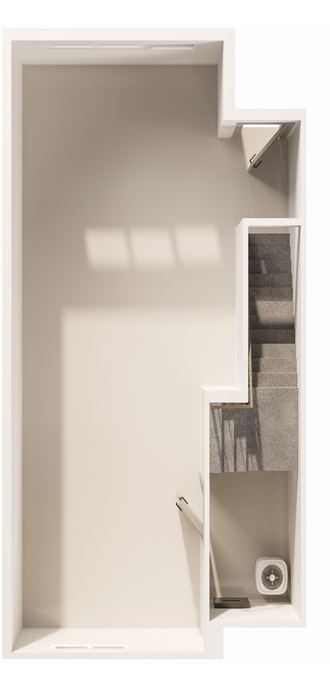
Undeveloped Basement I 571 SQ. FT