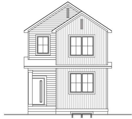
FRONT ELEVATION MODERN FARMHOUSE