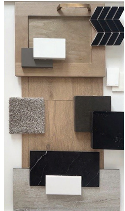
INTERIOR FINISHINGS | CORTES

Contact our sales team for more information: belvedere@crystalcreekhomes.ca | 403-984-3501