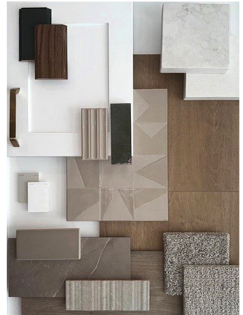
INTERIOR FINISHINGS | SIDNEY

Contact our sales team for more information: belvedere@crystalcreekhomes.ca | 403-984-3501