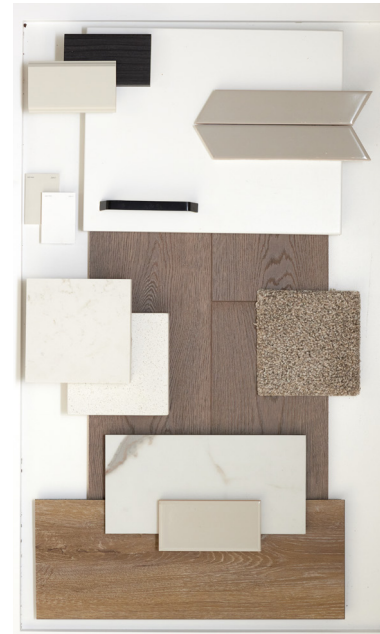
INTERIOR FINISHINGS | SOOKE

Contact our sales team for more information: belvedere@crystalcreekhomes.ca | 403-984-3501